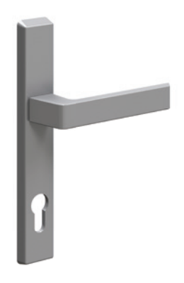
Hinged door hardware